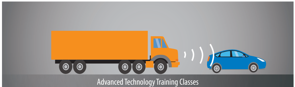
Advanced Technology Training Classes

Curriculum includes the fundamentals of compressed air; tactics for air system failure mode diagnosis and troubleshooting; and air brake system and foundation brake components, including air compressors, valves, foundation drum brakes and air disc brakes. This all-inclusive course incorporates description, operation, and service elements for the total range of components within dual air brake systems. Note that depending on the student's technical knowledge, Bendix recommends that each participant complete the online air brake training on brake-school.com before taking our in-person Air Brake Training (3-day class)*.