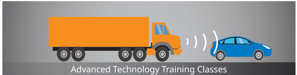
Advanced Technology Training Classes

Curriculum includes the fundamentals of compressed air; tactics for air system failure mode diagnosis and troubleshooting; and air brake system and foundation brake components, including air compressors, valves, foundation drum brakes, air disc brakes and an intro to GSBC (EBS) & GSAT (Global Scalable Air Treatment). This all-inclusive course incorporates description, operation, troubleshooting, and service elements for the total range of components within dual air brake systems. Note that depending on the student's technical knowledge, Bendix recommends that each participant complete the online air brake training on brake-school.com before taking our in-person Air Brake Training (3-day class)*.