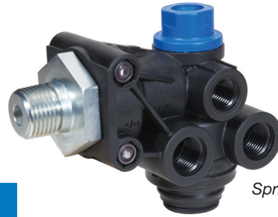
Bendix® SRC-7000™ Spring Brake Valve

In comprehensive testing conducted by Bendix Commercial Vehicle Systems LLC, our engineers compared the performance of the new Bendix® SRC-7000™ spring brake valve to valves available in the market today. The test evaluated overall durability and valve element breakdown.